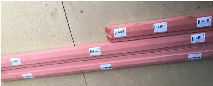
DOOR FRAME IN 3 PARTS MARKED A,B & C